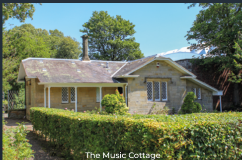
The Music Cottage